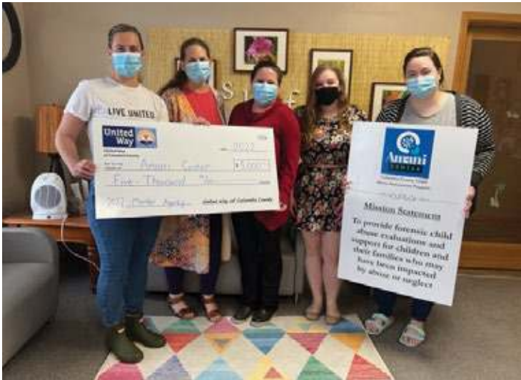
The Amani Center team used its 2022 United Way of Columbia County Allocation to ensure that children of suspected child abuse and neglect were connected to resources to begin healing.