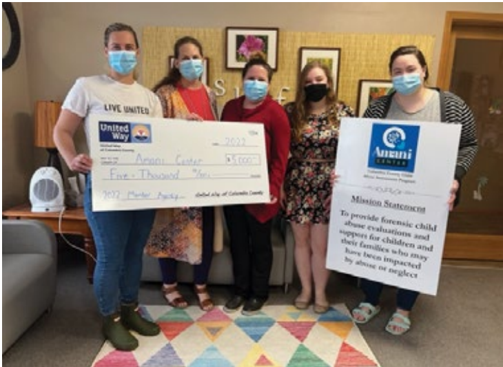
The Amani Center team used its 2022 United Way of Columbia County Allocation to ensure that children of suspected child abuse and neglect were connected to resources to begin healing.